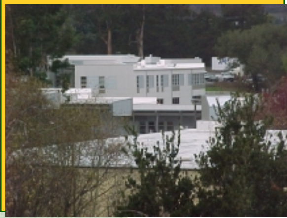
View from Soquel Avenue