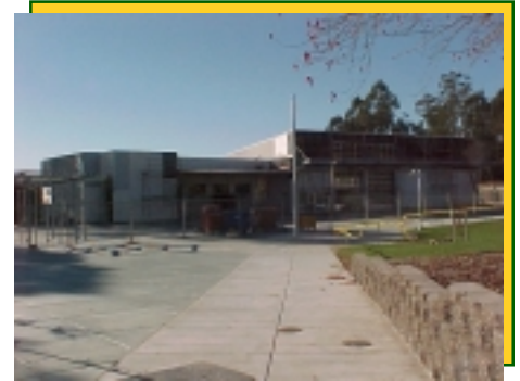
Multipurpose building nearing completion

The focal point of the campus has shifted to the areas that are now framed by these three new buildings. Students meander along